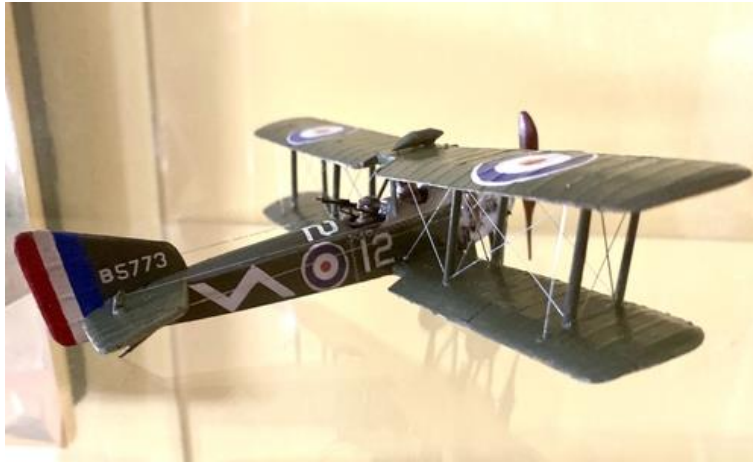
1/72 AVRO 504K