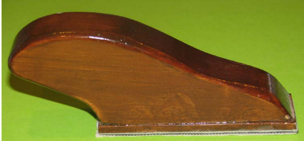
Picture of finished sanding block